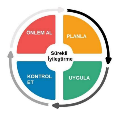
Figure 1. PDCA Cycle

The steps mentioned above can be summarized as the Plan-Do-Check-Act (PDCA) approach.